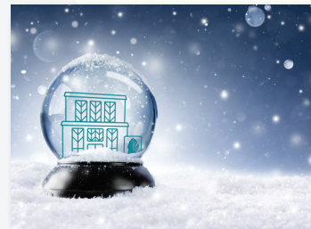
Give The Gift Of Food This Holiday Season