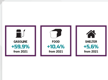
Rising Costs Lead To A Rise In Need