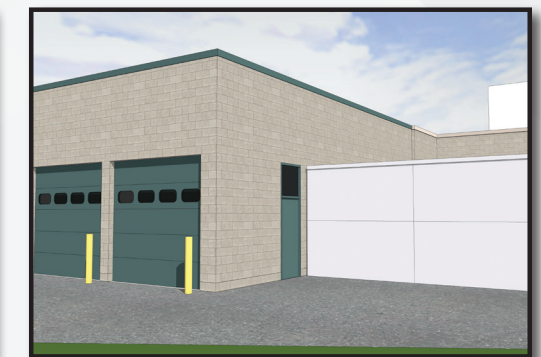
Renderings of proposed kitchen expansion (front and back)