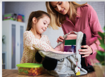
Feeding Kids Is A Year-Round Priority