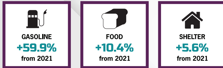
According to Bureau of Labor Statistics 10/2022

Today, in eastern Michigan, more than 211,000 people find themselves fighting hunger in their own homes. There has been little relief from the record-high inflation rates that have impacted our communities at the grocery stores, the fuel pumps and more. With colder temps approaching, utility costs will be on the rise again and those who were already struggling to make ends meet will find themselves even further behind.