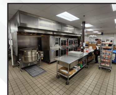
Interior of current kitchen