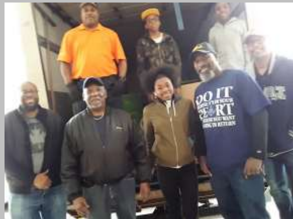
Volunteers during the annual NALC Food Drive.