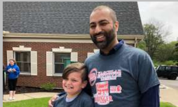
The Vascular Institute hosts an annual food drive.